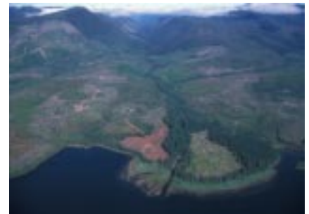
▲ Prince of Wales Island

Decades worth of timber – over five billion board feet – is available to the timber industry from areas in the Tongass where roads have already been built. That's enough timber to fill logging trucks stretched end-to-end from Washington DC to San Diego, California - five times over! These areas do not require expensive new taxpayer-subsidized road-building. Yet the timber industry and its allies continue to push for more and the Bush administration continues to plan to log irreplaceable trees in roadless areas.